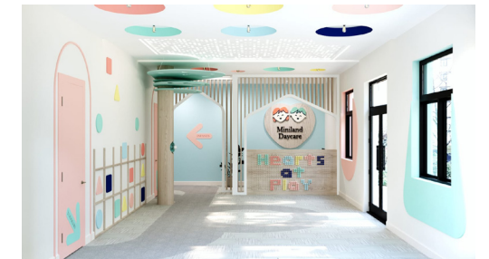
Miniland Daycare in Boro Park