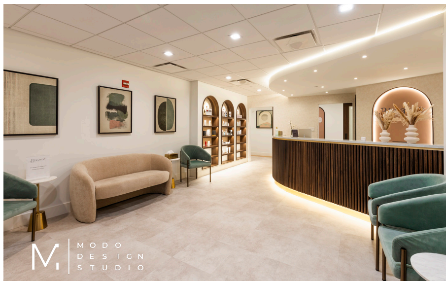
Biscayne Dermatology Clinic in South Florida

questions that came up in class were a huge part of the learning process. Second, from the instructors. These were people in the field for 7-8 years with real-life exposure, providing amazing insights about actual jobs they were working on. And third, from the vendors. When we learned about tiles, a tile vendor came to the class and showed us different tiles and where they would best be applied. Same for lighting. We saw, felt, and experienced real-life examples of what our everyday would look like as designers.