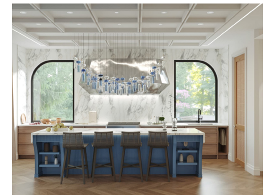
Residential home in Boro Park