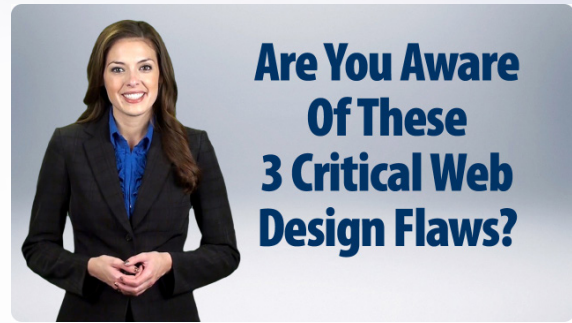
This is the EXACT SAME video hosted on our website with a customized thumbnail. (Yes, it has rounded corners on the video.)

At Tipping Point Marketing, we host our client's videos for them and triple encode all of our videos for our clients so that they play back seamlessly in HD (high definition), SD (standard definition), and on mobile devices without forcing visitors to leave the page. And yes, they work perfectly on iPads and iPhones, everytime—even when streaming over cellular networks. Additionally, we always custom create a video thumbnail so that visitors to your website will want to push play and actually watch your video.