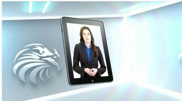
This is the actual thumbnail for one of our videos on YouTube (the thumbnail is generated by YouTube).

our website. Which one would you be more inclined to click and watch?