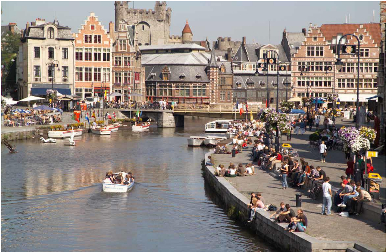
Graslei quay in city centre of Ghent