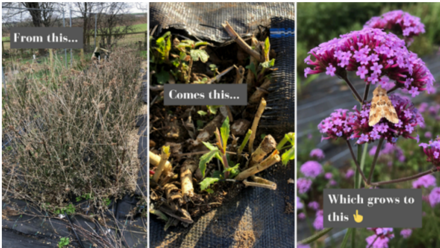
Cut down Verbena bonariensis

If new shoots are starting to show at the base of your plants, it's time to cut down last year's growth, even if it's been producing new foliage (if you're in a colder region you may want to wait another week or two). This is also a good time to reposition any Verbena that has self-seeded. Although lovely as a tall-stemmed cut flower, Verbena doesn't respect your well-laid out boundaries, so you'll need to keep it in check! Pot up unwanted plants and pass them onto friends and neighbours (see our piece above on dividing perennials).