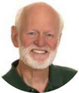
MARSHALL GOLDSMITH THINKERS 50 #1 EXECUTIVE COACH FOR 10 YEARS